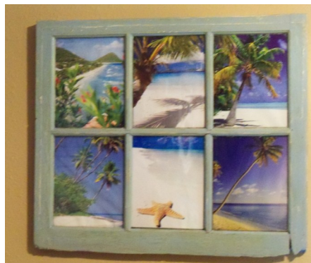
July 15th Project Workshop item.