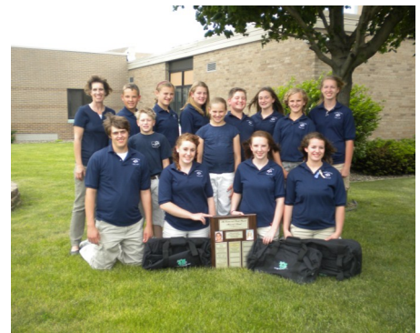
Dairy Quiz Bowl team members