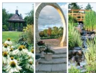
2012 Garden Calendar celebrating Public Gardens of Iowa

The Public Gardens of Iowa information is complete with locations, websites, and hours of operation, so you can plan excursions to these sources of civic pride and gardening know-how. In addition to stunning and inspirational photographs, every page provides tips on what