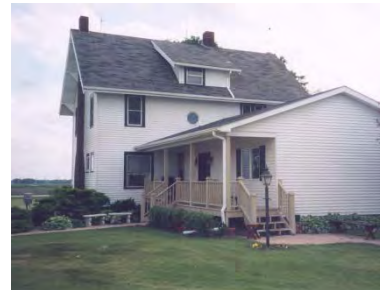
Figure 3 1 st addition with porch