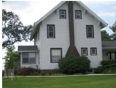
Figure 2 East Side