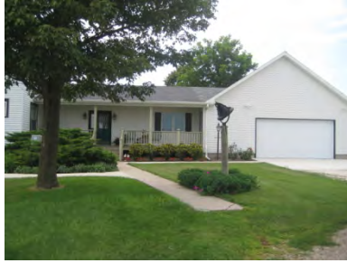
Figure 4 2 nd addition (garage)