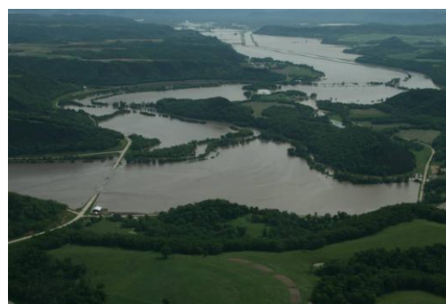
Flooding of the Upper Iowa River between Dorchester and New Albin.

DISASTER RELIEF FOR FAMILY FARMERS Midwestern family farmers have been hit with historic levels of storm and flood damage this spring. Without federal crop insurance, farmers who produce local foods for market are especially vulnerable. In a year when demand for locally grown foods is at its highest, many towns' farmers' markets have closed down due to flooding or product shortages. "We have been hearing from family farmers all across the state who have been devastated by storms and flooding," said coalition spokesperson Denise O'Brien, an Atlantic farmer. "We want to get assistance to these farmers as quickly as possible, and we thank our long-time friends at Farm Aid for helping us out." Click here to make a donation in support of relief efforts in Iowa and across the Midwest.