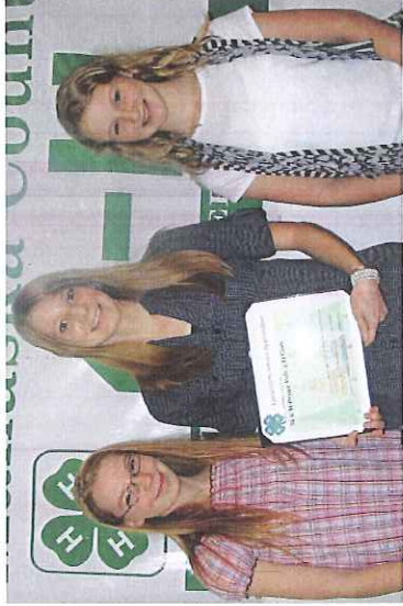
M & M Peppy Pals 4-H Club Oskaloosa Chamber Community Service Award Recipient