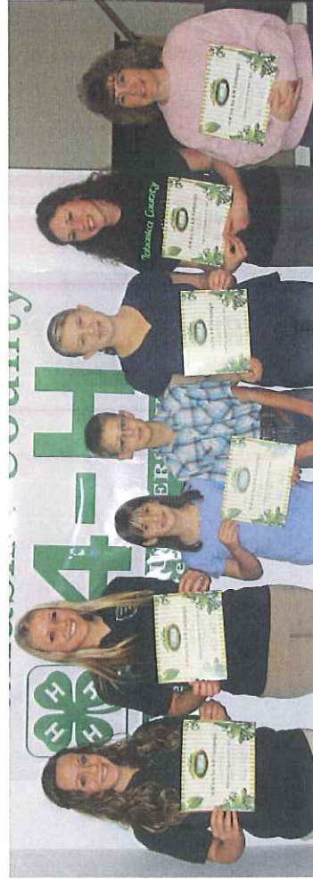
4-H'ers for 4-H Campaign Donors Harrison Zippers, Mahaska Masters, Cedar Livestock, Garfield Boosters, Harrison Hustlers, Leighton Strivers and not pictured Scott-U-Need-U 4-H Clubs