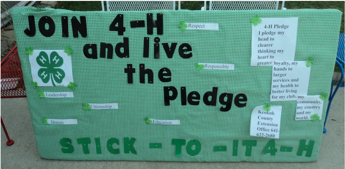
Left: Stick To It display at Keokuk County Veterinary Clinic