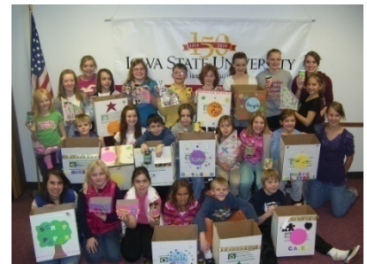
Green Clovers held a Fun Night and decorated recycling boxes.