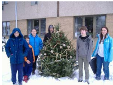
Montana Miners recycled a Christmas tree into a bird feeder at nursing home.