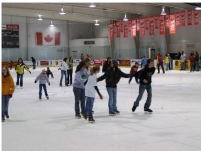
Luther Livewires 4-H members enjoyed ice skating in Ames

Rules: Divide members into 2 teams. Lay alphabet cards on two chair 10 feet from teams and mark a baseline 10 feet further back from the chairs. Leader announces a word and the first players on each team, as many as there are letters in the word, go to chairs, select letters, carry them to base line, and stand holding the letters in correct order. First team finishing word correctly gets a point. Players return cards to chair and they return to back of their team so next players take next word.