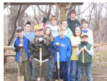
4-H Shooting Sports members move mulch to shooting shelter at 4-H Camp

www.iowastatefair.com/competition/howtoenter.php . Entry forms are not online but will be available from the Extension Office in early June. State fair entry forms and fees are can be turned in the same time as county entries on June 23 or no later than July 1. The following information is needed: signatures of 4-H'er and parent, number of animals, staying in Youth Inn, and entry fees.