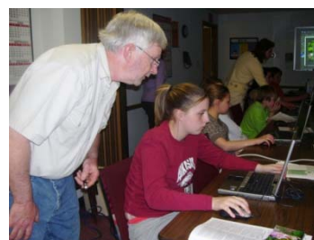
4-H Photography project members learn