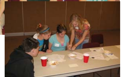
YC 2 works to decipher what their fellow council members were making in play dough Pictionary.