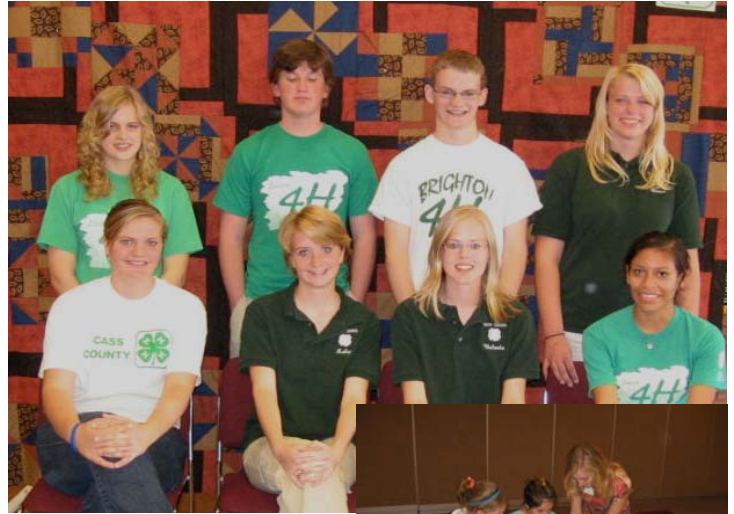
(Above) The 2008-2009 Cass County Youth Council during their debut appearance at County Convention.

The Intermediate Council (YC2) was also named and held their first meeting at the community center.