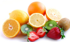
Food & Nutrition