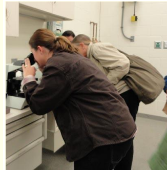
Looking for Parasites

For more information go to http://www.extension.iastate.edu/masterequine