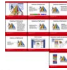
N 3471a-j MyPyramid overheads set of 10 ($9.00*)