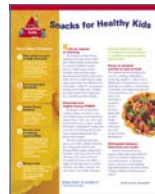
PM 1264 Snacks for Healthy Kids 4 pg. ($1.00*)