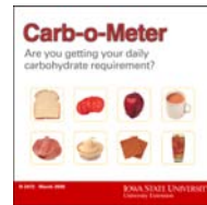
N 3472 Carb-o-meter CD ($5.00*)