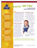
PM 1257 Food for 'METOO' 4 pg. ($1.00*)