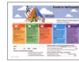
N 3478 Foods in MyPyramid 2 pg.; 50 per pad ($7.75*)