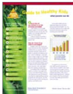
NCR 374 Guide to Healthy Kids—what parents can do , 4 pg. ($1.00*)