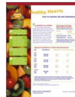
PM 1967 Healthy Hearts—how to monitor fat and cholesterol , 2 pg. ($1.50*)