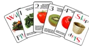
PM 1978set Give Me 5! card game ($5.00*)