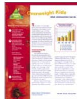
PM 1884 Overweight Kids—what communities can do , 4 pg. ($1.00*)