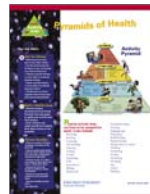
PM 1950 Pyramids of Health , 2 pg. ($1.50*)