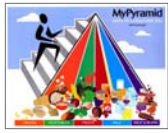
EDC 335 MyPyramid Poster 2 pg.; 100 per pad ($3.50*)