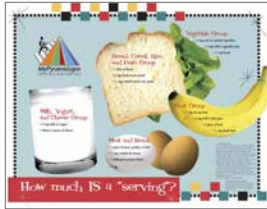
N 3447p Portion Proportion placemat (11 x 14 in. coated paper; 4 per pkg.) ($1.00*)