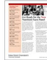
PM 1979 Label Reading series ($.50* per title)