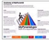
EDC 339 Anatomy of MyPyramid 1 pg; 25 per pad ($7.50*)