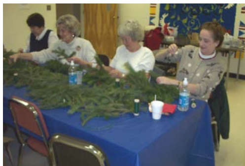
Workshop participants will create their own holiday wreaths.

Nov. 27 at the Humboldt County Extension Office, 10am – noon. Call 515-332-2201 to register.