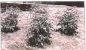
This photo shows the Dodgen Tomato Cage with tomato plants at an earlier stage. John N. Dodgen said the key is keeping the tomatoes off the ground.

Up to three tomato plants can be planted in each cage. Dodgen said by using a 12" diameter and 12" high plastic pipe in the middle, it can be filled with water that goes straight to the roots and not on the leaves. "This eliminates blights," Dodgen said. Five people without space for a garden, Dodgen said a person only needs a four and one-half of space in a grassy area. "Guns actually build the structure is better and there are no north aspects leaning on the leaves from the evening light. There's also no shading," Dodgen said. The cage can be used for those who want to put the plants in a large tub. "People with no yard can use a tub and have tomatoes all summer long," Dodgen said. Dodgen is now in phase his season growing tips with others. He uses a mixture of four parts water and one part milk and sprays it on the plants during blossoming stage to control blight. He waters every three days and fertilizes once a week with Miracle Grow. "You can't water tomatoes too much. It keeps them from cracking," Dodgen said.