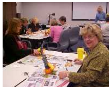
Come discover your creative ability!