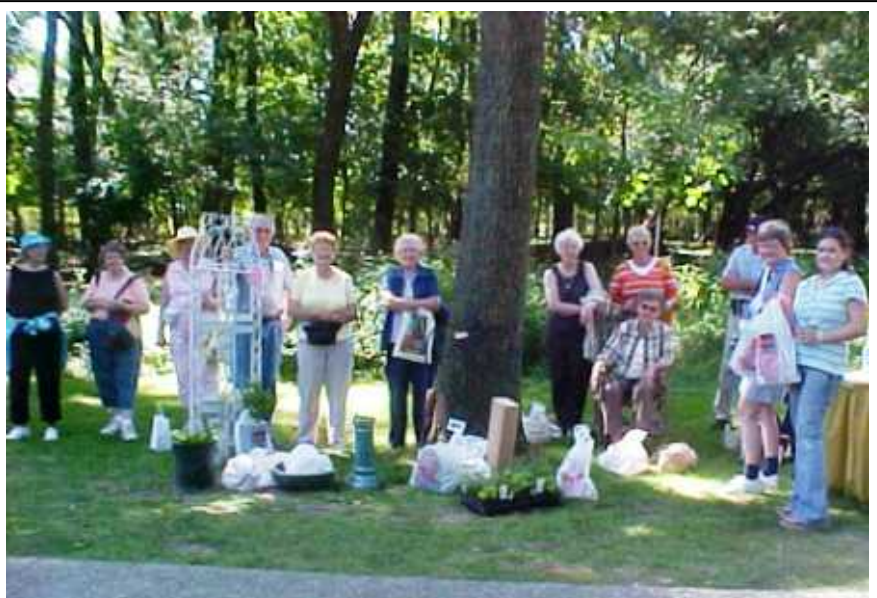
Waiting to load the bus with all their loot! Birdbaths, garden ornaments, trellis & stakes, flats of plants, 10¢ herbs...a garden shopper's paradise!