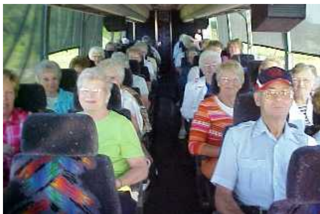
All aboard and on our way! A better appreciation of stewardesses was had following serving drinks and snacks on a moving bus...