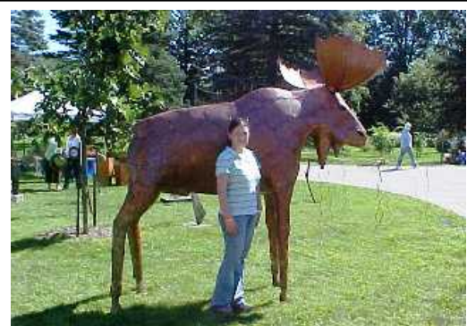
...and luckily, no one on the bus purchased this moose – but as we gardeners are skilled at packing vehicles to the max – we would have tried to find the room to bring it home!