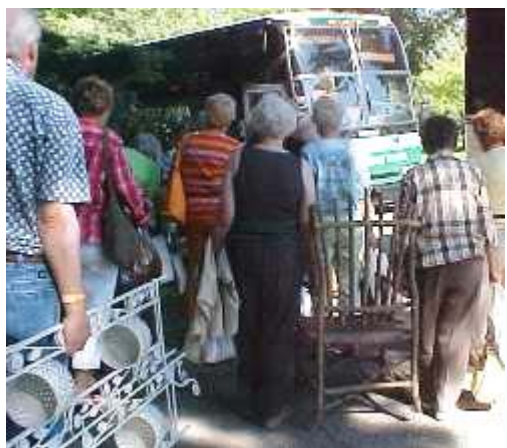
Attendees brought home everything but the kitchen sink! From willow chairs to Japanese Maple Trees – thank heavens for the large under bus storage areas!!