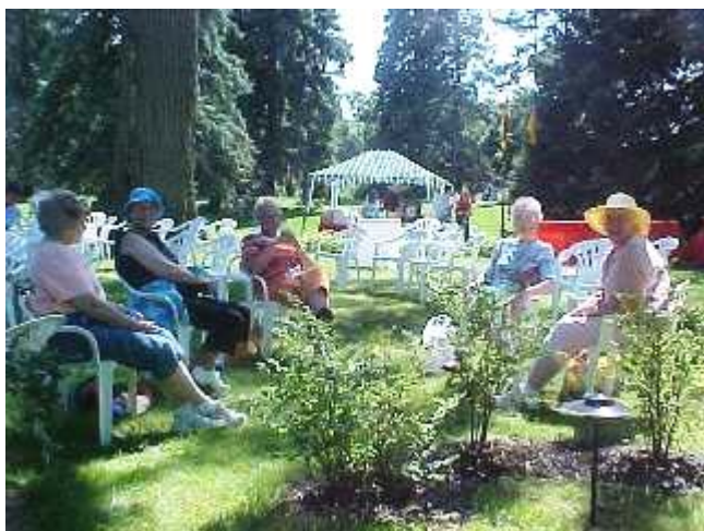
A garden party atmosphere on the beautiful grounds.