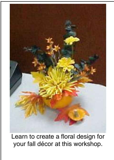
Learn to create a floral design for your fall décor at this workshop.

Mid-Iowa ISU Extension Horticulture will sponsor floral design workshops to be held in the four-county area this fall.