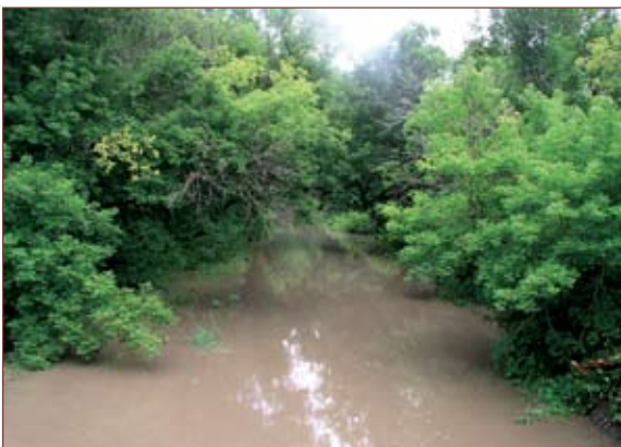
Sediment deposits in an Iowa river.