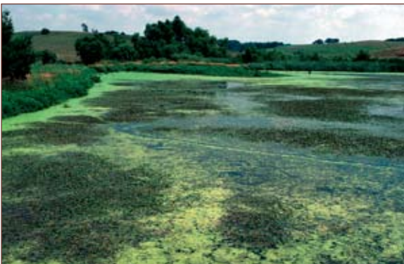
Algae bloom in an Iowa pond.