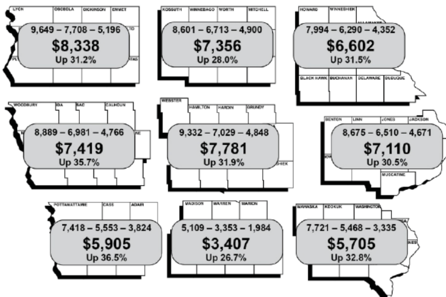
Figure 3. 2011 Land values by crop reporting district.

Estimates of average dollar value per acre for high, medium and low grade farmland on Nov. 1, 2011, by Iowa Crop Reporting District; and the Crop Reporting District average and the average percentage change from Nov. 1, 2010. The estimates are based on a survey conducted by Iowa State University Extension.