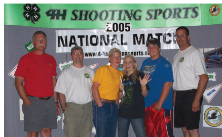
2005 SESS National Match

4-H Shooting Sports is a relatively new project area that has recently gained new life. As a key focus area for the Iowa 4-H program, Northwest Iowa has begun training adult volunteers to teach responsibility and technique in the 4-H Shooting Sports project. The goals of the program are to teach safe and responsible use of firearms and archery equipment, promote high standards of sportsmanship, encourage understanding of our natural resources, enhance the development of young people, expose participants to possible careers, and to strengthen families through life-long recreational activities. If you’re interested in helping begin a shooting sports program in your county, contact your local Extension office or Judy Levings at the State 4-H Office, jlevings@iastate.edu .